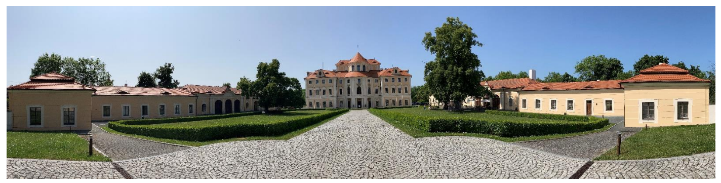
Conference center of the Academy of Sciences of the Czech Republic, Liblice Castle near Prague, April 28-May 2, 2024