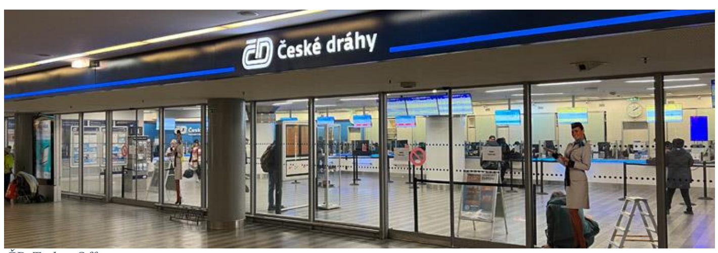
CD Ticket Offices